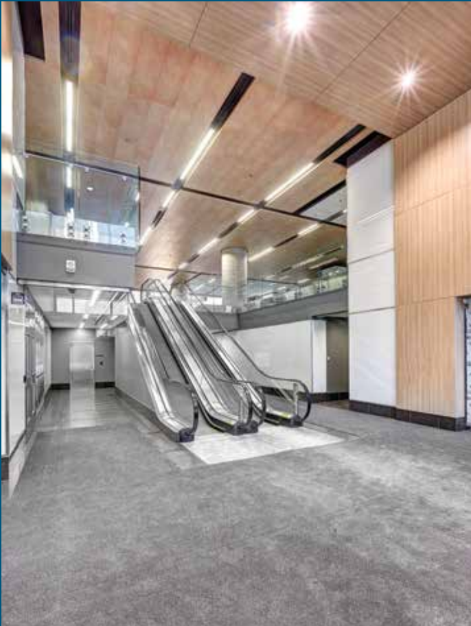
Important to the building owner, SpanAir hook-on ceiling panels provide easy access to the plenum for potential repairs and updates to wires, pipes, ducts and other components.