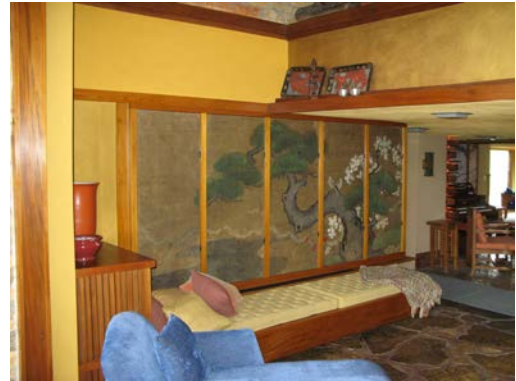
Photo of completed installation.